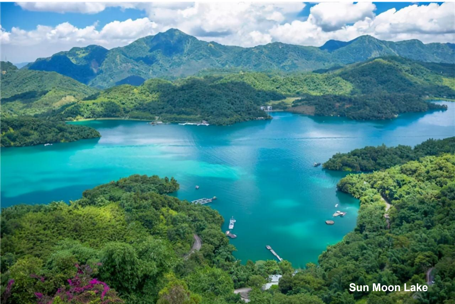
Sun Moon Lake

We are looking forward to your feedback!